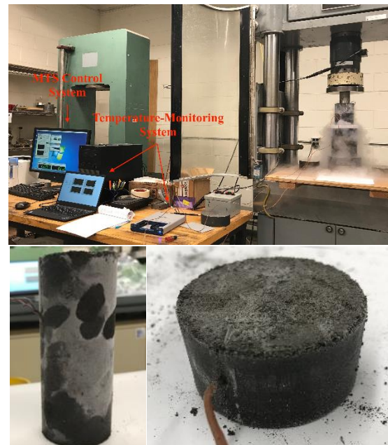
Fig. 1 A modified strength testing system and UCS and BTS specimens of frozen regolith simulant

and different cryogenic temperatures that varied from -190°C to -130°C. Figure 1 shows casted UCS and BTS specimens, as well as a modified strength testing system, which combines the temperature monitoring and the standard MTS press and data acquisition and monitoring system used in strength testing program.